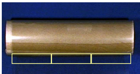
Three sections were cut from the polymer roll and attached to a 75 x 75 mm sample platen for analysis in the Quantera II .

The Quantera II 's instrument control software provides the ability to quickly define an array of data points across a sample section and automatically position the sample at the focal point of the analyzer. In this example, 180 locations were analyzed across the 8.5 inch wide roll.